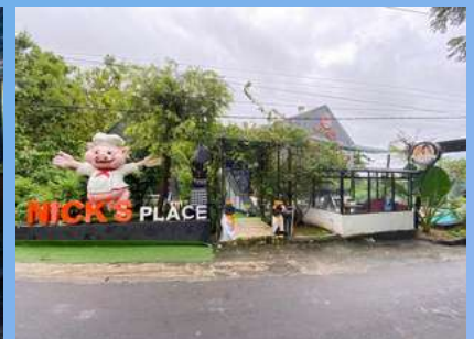
now move to new place in 2021