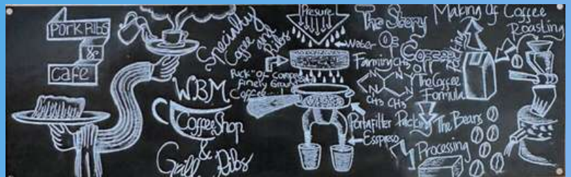
my first picture in 2015