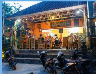
in beginning 2015