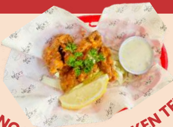
LEMBONGAN SPICY CHICKEN TENDER

SAUTEED SHRIMPS NO SHELL AND NO TAIL OF IN NICK'S SECRET RECIPE CAJUN BUTTER SAUCE SERVED WITH GARLIC BREAD FOR DIPPING