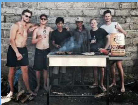
my first customer in 2015

It make me very happy to see all kinds of holiday makers from around the world joining us here at Nick's Place and we hope that you enjoy your meal here. We are honored to have loyal customer like you and thank you for being a part of our journey and for helping us succeed.