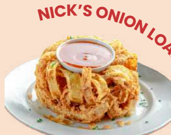
NICK'S ONION LOAF