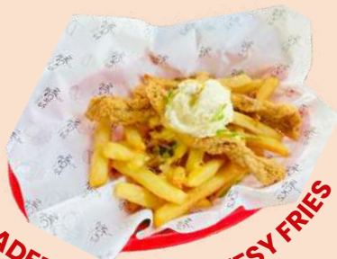
LOADED CHICKEN CHEESY FRIES